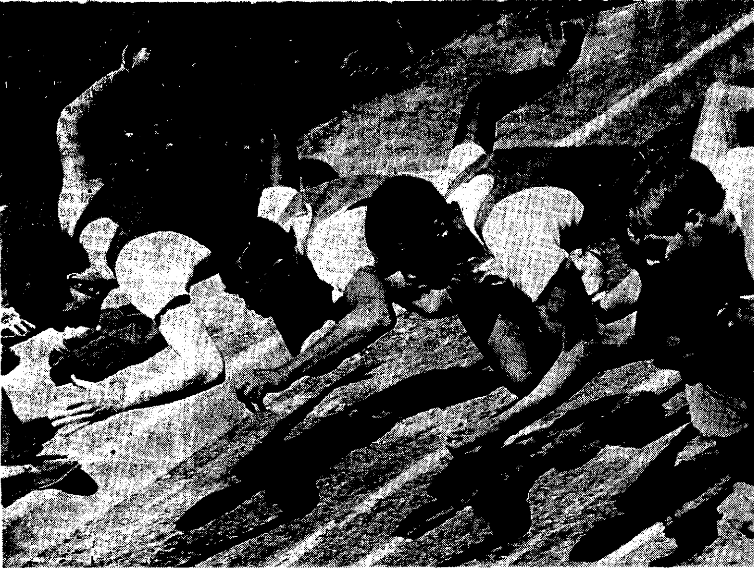
THEY'RE OFF—This unusual camera caught these runners in a preliminary of the 100-yard dash in the Southwestern Conference Relays Saturday at Public School Stadium.